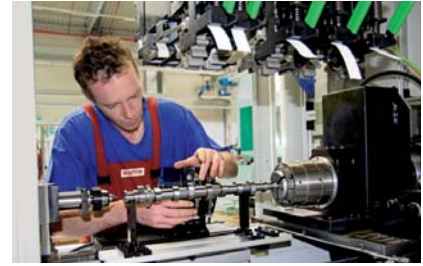
Easy accessibility via movable tools