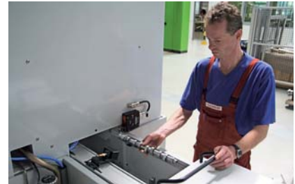
Manual loading or simple integration into automatic systems